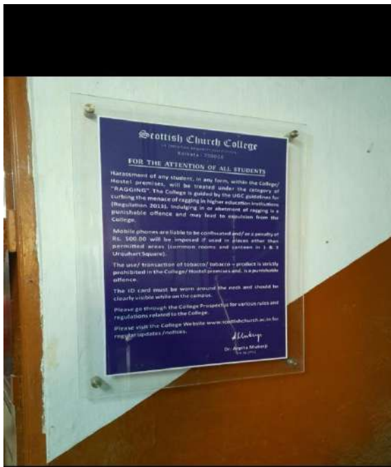
Azad Hind Bag, Manicktala, Azad Hind Bag, Kolkata, West Bengal 700006, India 16 Jan 2020 01:55 pm 27.0 °C