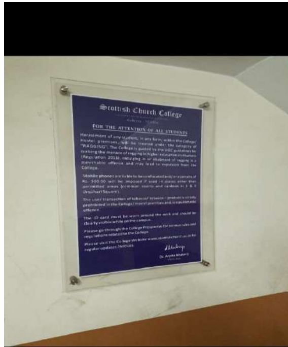
20B Radhanath Bose Lane, Abhedanand Rd, Manicktala, Azad Hind Bag, Kolkata, West Bengal 700006, India 04 Feb 2020 03:17 pm 23.0 °C