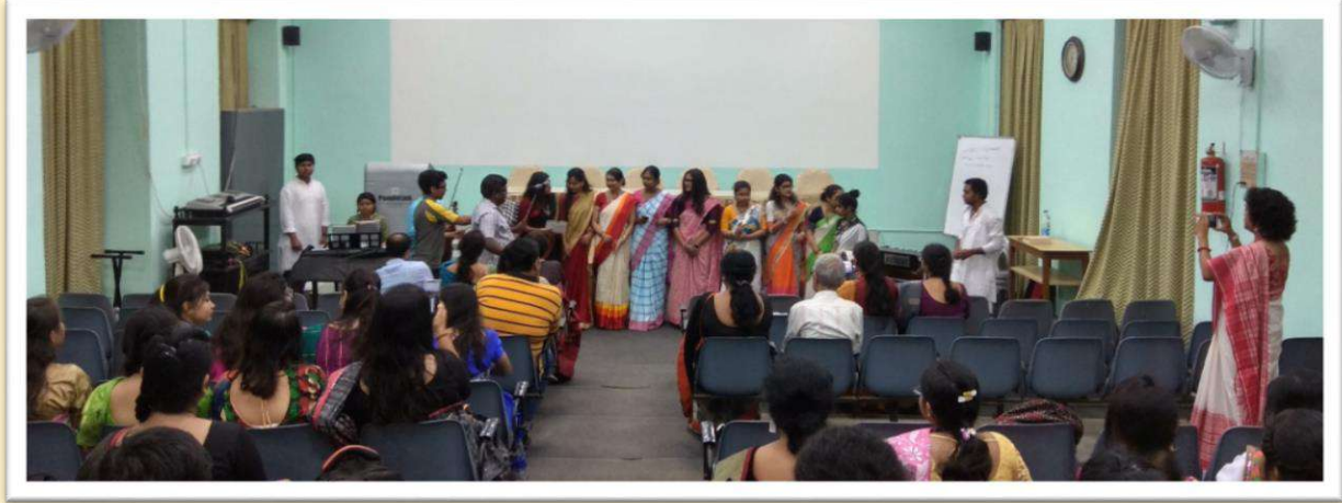
Figure 1: 21st February Celebration