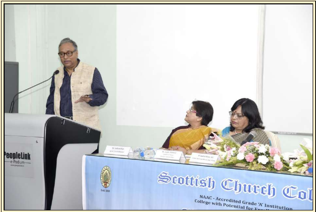
Figure 7: Introductory lecture by Sri Jawhar Sircar, IAS