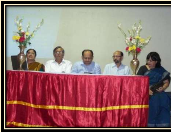
Figure 3: Eminent Personalities on the Dias